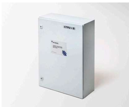
CTPU ENCLOSURE - 8