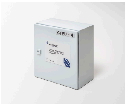
CTPU ENCLOSURE - 4