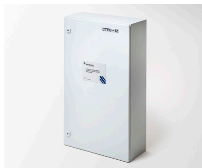
CTPU ENCLOSURE - 12